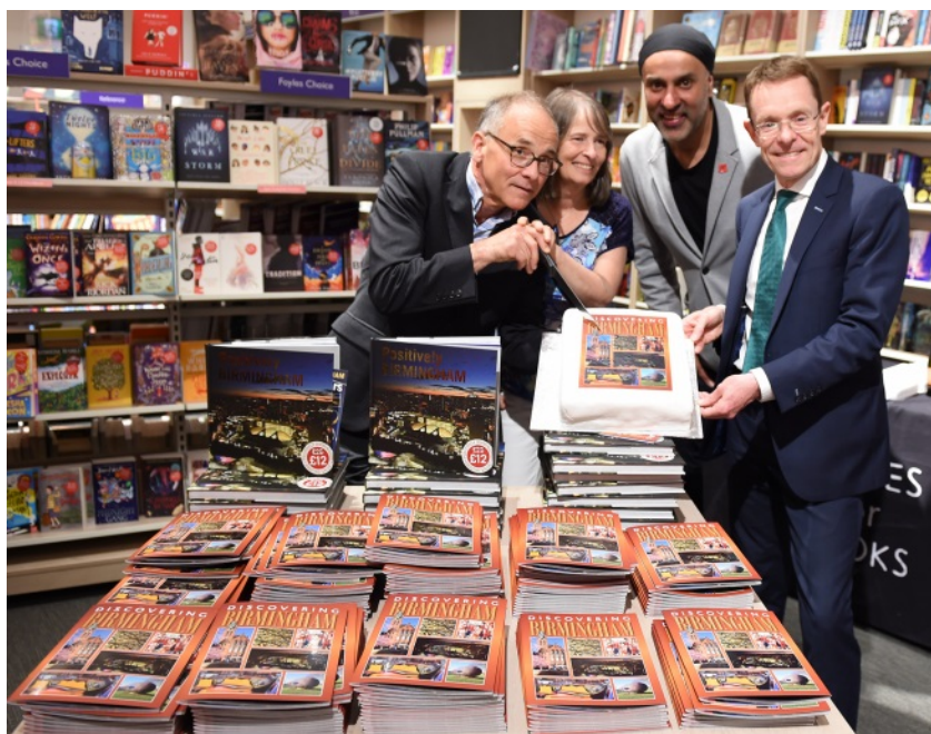
Discovering Birmingham launched at Foyles book shop in Grand Central with the help of West Midlands Mayor Andy Street

City Centre Map and things to see and do: Back inside cover with list of things to discover.